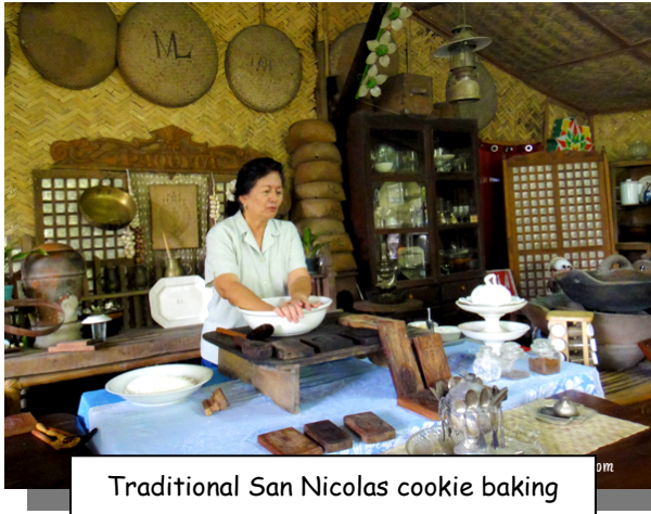
Traditional San Nicolas cookie baking